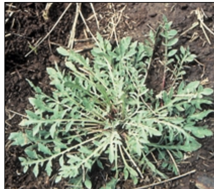
Figure 3.—Diffuse knapweed, rosette stage.

Knapweeds bloom white, pink, purple, or yellow from June through October. See page 3 for descriptions of these weeds. Figures 1–9 show the four species in their rosette and mature stages. Control methods are discussed below.