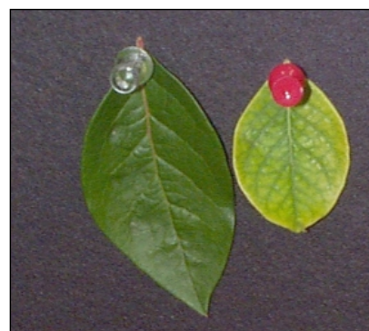
Figure 1.—Normal blueberry leaf (left) and iron-deficient leaf (right). Note the pale green leaf area and contrasting green veins on the iron-deficient leaf.