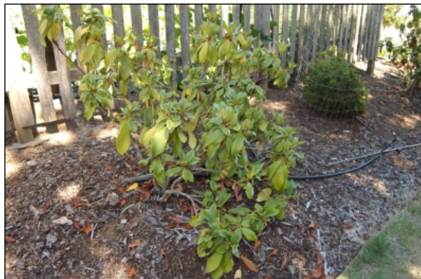
Figure 2.—Yellowed leaves do not always indicate that the soil pH is too high. This rhododendron is growing in soil with a pH of 5.4. Always check the soil pH before deciding to acidify your soil.