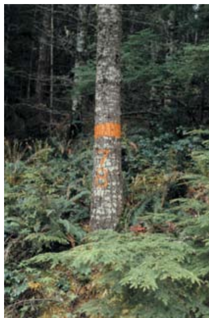
Figure 6.—Within a harvest area to be clearcut, mark the leave trees (for wildlife, if applicable, and for Oregon Forest Practice law requirements) to show loggers which trees must not be harvested.

The seller also is responsible for paying self-employment taxes, which can be costly, as well as the Oregon Forest Products Harvest Tax and potentially a severance tax, depending on the seller’s property tax program.