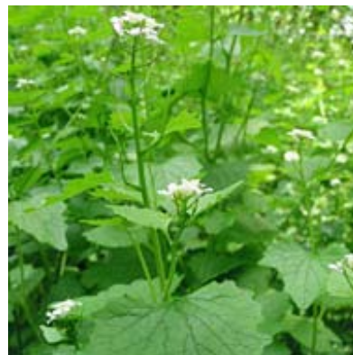
Figure 2 (far left).—Garlic mustard leaves.

The following information about herbicides is only a brief summary; consult your local Extension agent or