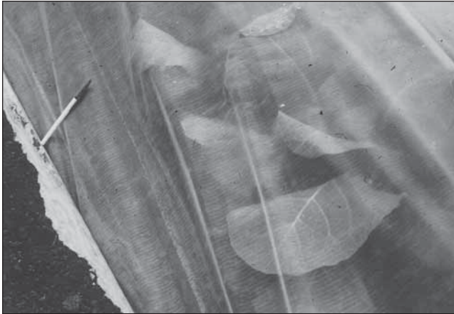
OSU Extension Service