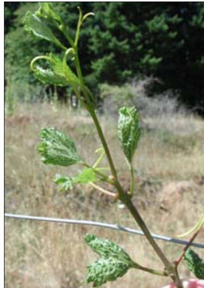
Figure 5. Herbicide damage caused by early-season phenoxy herbicide application. Scarring is not present.