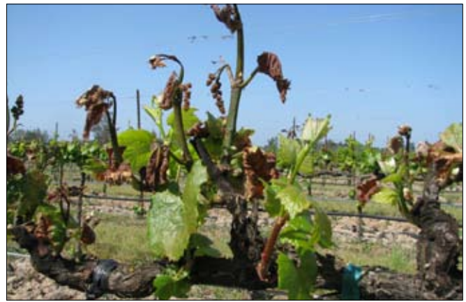
Figure 4. Frost damage.

Distinguishing from SSS Usually, shoot scarring (Figure 2) is not seen in vines damaged by herbicide.