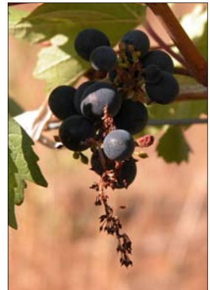
Figure 6. Herbicide damage has reduced fruit set in this cluster.