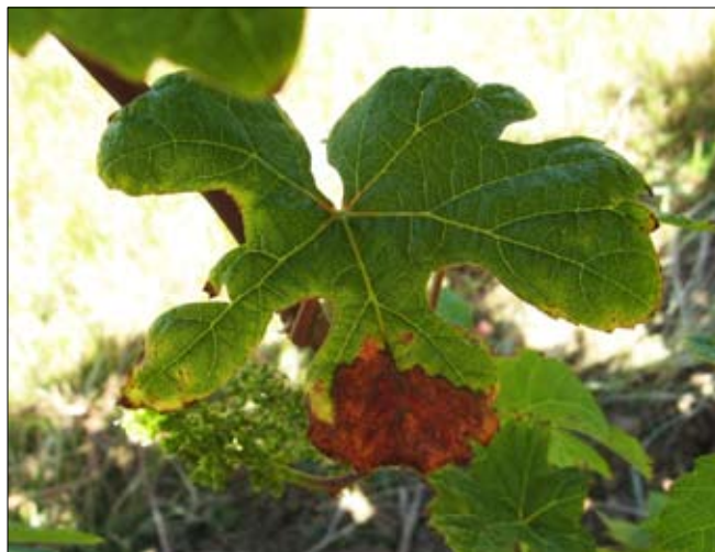
Figure 9. Boron toxicity. Note the cupped leaves and wide leaf sinuses.