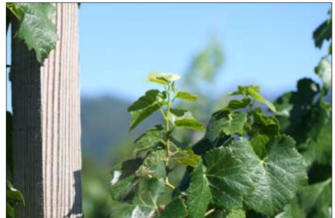
Figure 8. Shortened internodes and small leaves due to B or Zn deficiency.