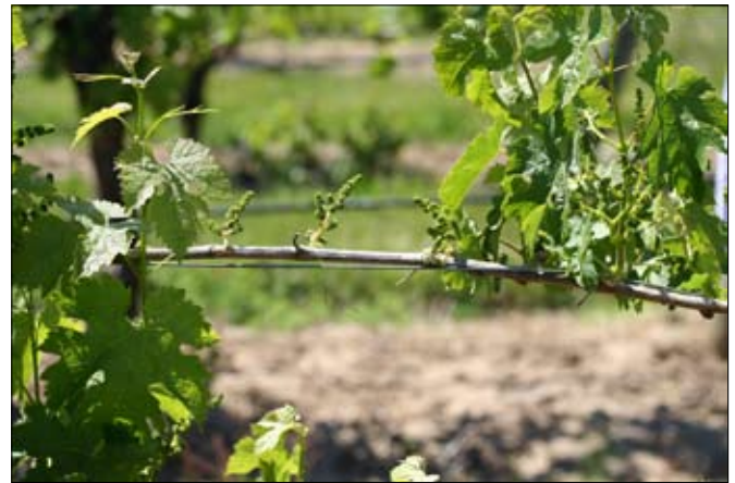
Figure 7. Vine imbalance. Overcropping can lead to bud failure, as seen on this Merlot vine. Note flowers with little or no leaf area. These flowers will not set fruit, resulting in blank areas of the cane or cordon. These symptoms are usually uniform throughout the affected areas.

If you suspect micronutrient deficiency, collect and analyze vine tissue samples. This is usually done with petiole samples collected at bloom or before veraison. Tissue analysis can confirm the diagnosis and allow you to develop a vineyard fertilization plan to correct the deficiency.