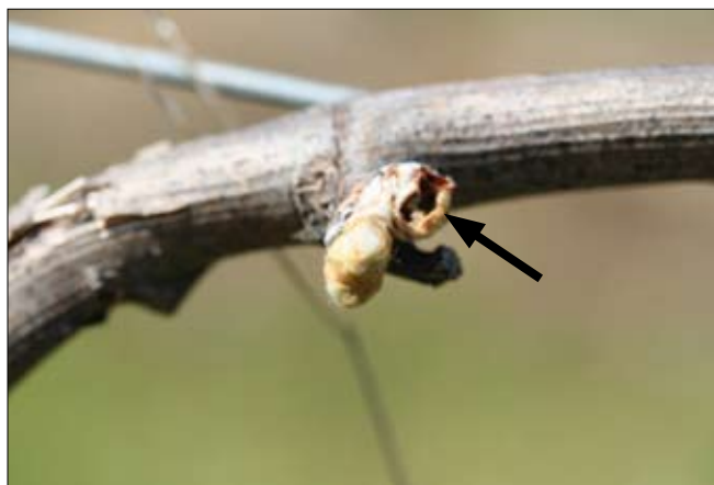
Figure 10. Close-up of bud damaged by cane borer (arrow).