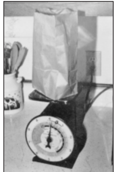
Figure 3.—Weigh your sample again. Repeat the drying and weighing until your sample's weight doesn't change.