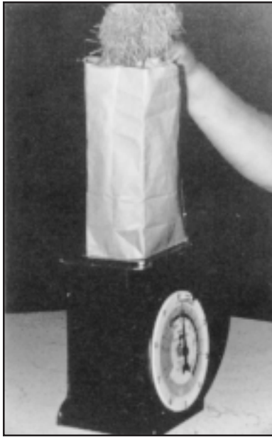
Figure 1.—After you place your forage in the bag, weigh it again.