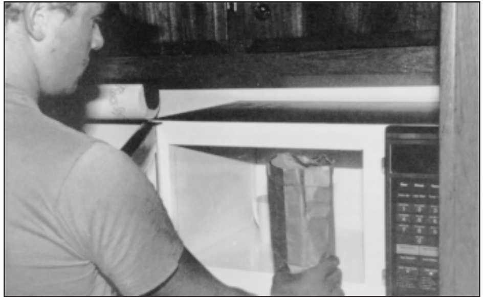
Figure 2.—Dry your sample for 3 minutes, medium power setting.

For green chop, haylage, or silage, follow this procedure: