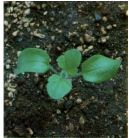
Figure 3.—The larger center lobe of the leaf is visible on the seedling of ivyleaf speedwell.