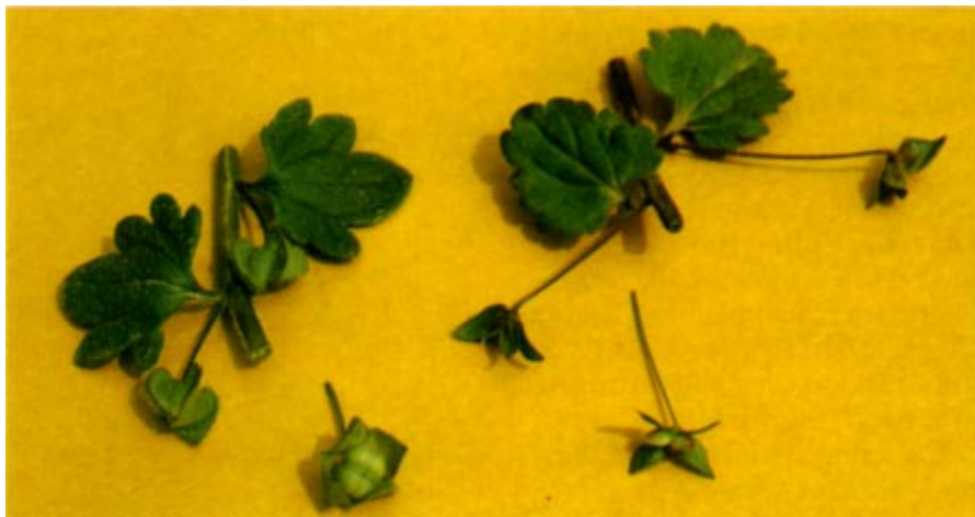
Figure 2.—Ivyleaf speedwell leaves (left) have a larger center lobe, compared with the toothed leaf margins of Persian speedwell (right). Fruits are round, compared with the flat, heart-shaped fruits of Persian speedwell.