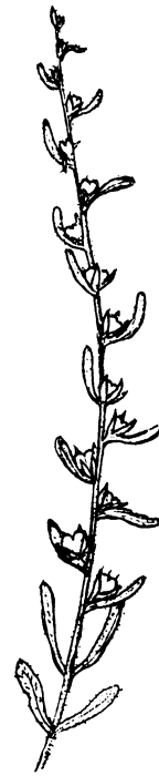
Figure 7.—Purslane speedwell.