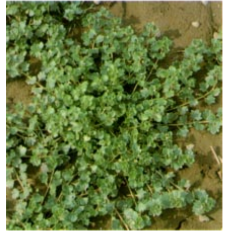
Figure 9.—Persian, ivyleaf, and creeping speedwell spread over the ground, rooting at the nodes.