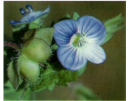
Figure 1.—Persian speedwell flowers are sky blue with white centers.

Other species in the same family are also becoming weed problems because of their tolerance for so many herbicides.