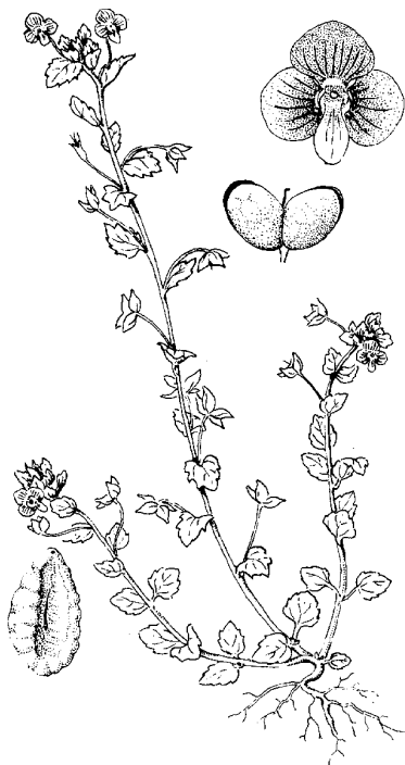
Figure 4.—Persian speedwell.

Purslane speedwell is an annual. The stem is erect, simple or branching from the base, and up to 12 inches tall. Leaves are oblong to linear. The lower leaves narrow to a stalk, while the upper leaves are without stalks. On the lower stem, leaves are opposite; on the upper part, leaves are alternate and have minute white flowers in the axils (Figures 7 and 10). Plants may be hairless or hairy.