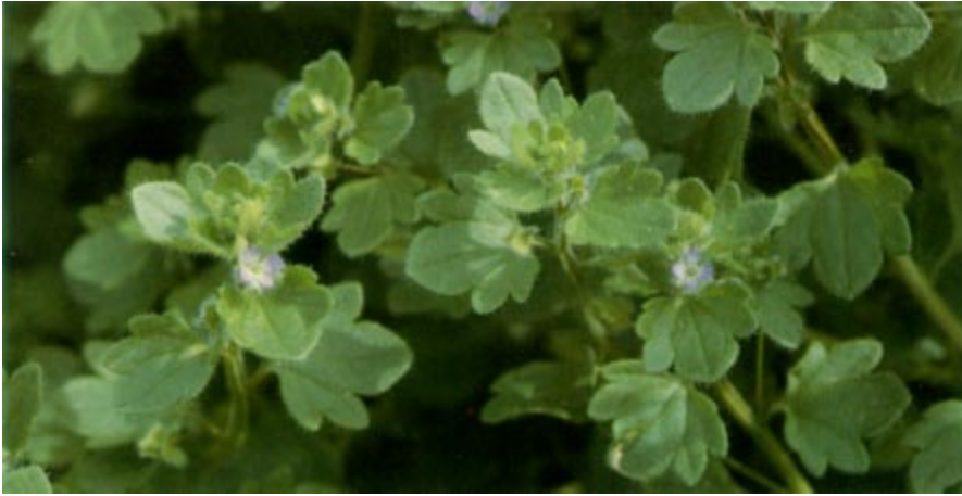
Figure 8.—Flowers of ivyleaf speedwell are tiny and pale blue.