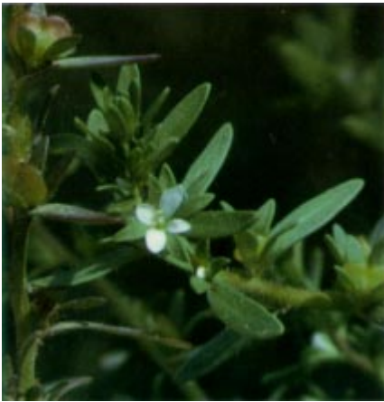
Figure 10.—Purslane speedwell has oblong leaves, with tiny white flowers in the leaf axils.