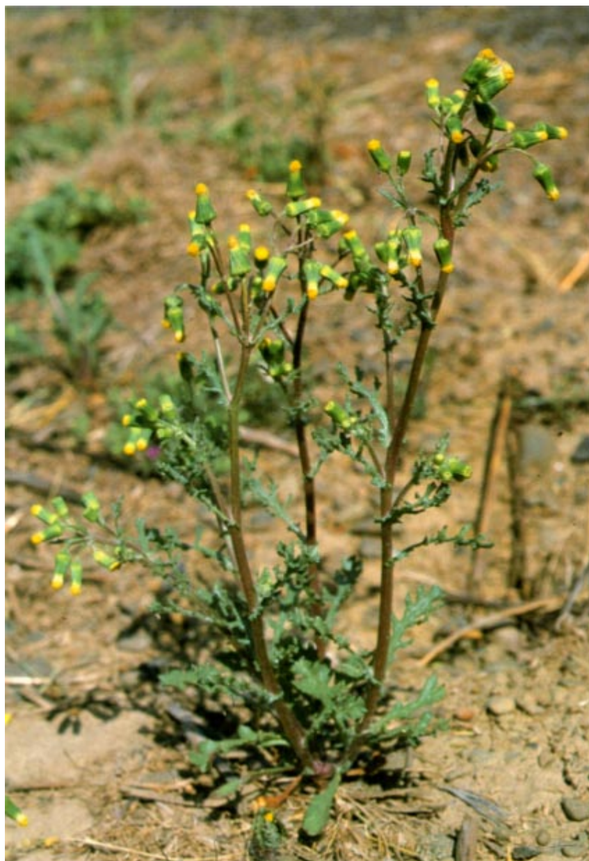
Figure 1.—Common groundsel grows from 4 to 18 inches tall. Leaves are deeply lobed with toothed margins. The lower stems and undersides of basal leaves usually are purplish-colored.

Susan Aldrich-Markham, Extension agent, Yamhill County, Oregon State University.