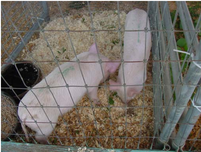
4-H pigs were part of Myrtle Point Harvest Festival Petting Fair.

The next public event for 4-H will be presentations during National 4-H Week. Members and clubs are encouraged to approach businesses and ask for space to display project work or posters about 4-H in Coos County. If each club had a photo board, craft, or educational display available for the public to view during the week of October 5-11, it might very well be a reminder that 4-H enrollments are being taken at this time. We are kicking off the new year, and if each member invites a friend to join their club, we could double our enrollment.