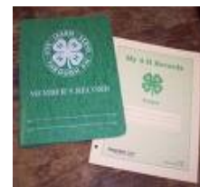
Photo ID available at various 4-H events.

Don’t have your photo ID badge for the fair yet? We will be set up to take your photograph at the following events.