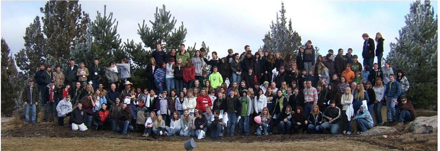
High Desert Leadership Retreat—Nearly 150 Youth Attend (Story Pg 4)