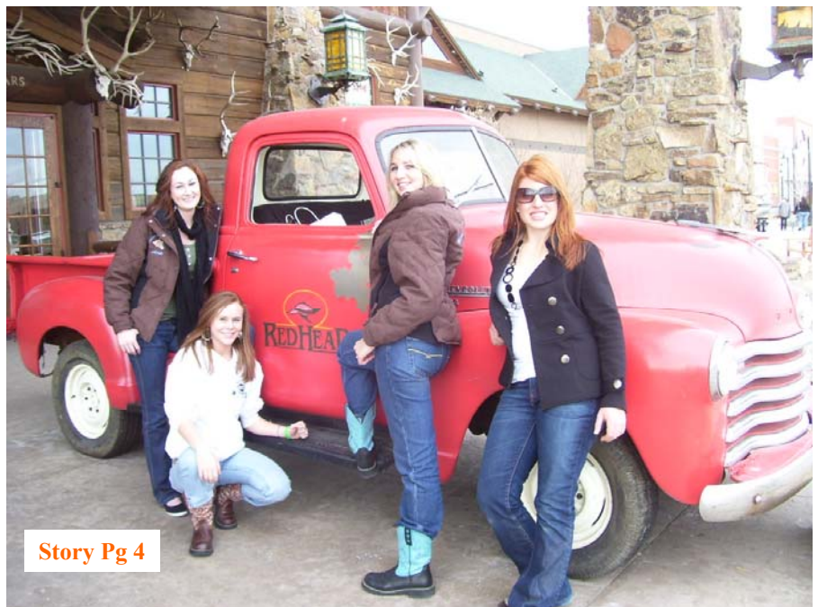
Story Pg 4