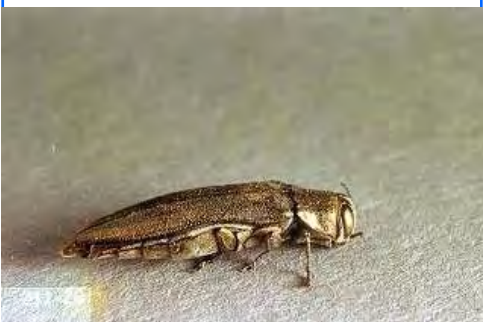
Agrilus anxius Brassy girl seeks boring boy. Tree lovers reply to: bronzie@arthro.net