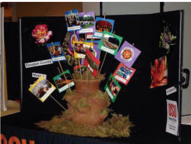
Douglas County Master Gardener's Display