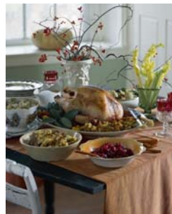
Recipes from the Pantry to the Kitchen