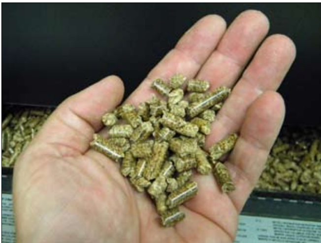
Figure 3.— Wood pellets.

Wood pellets (Figure 3) are usually sold in 40-pound bags. Prices are often expressed in dollars per ton (fifty 40-pound bags). Pellet fuels typically have a moisture content of around 5 to 10 percent. Good-quality wood pellets at 5 to 10 percent moisture content have a heating value of approximately 16,500,000 BTU/ton or about 8,250 BTU/pound.