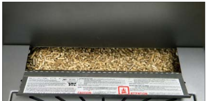
Figure 5.—Wood pellets in a pellet stove hopper.