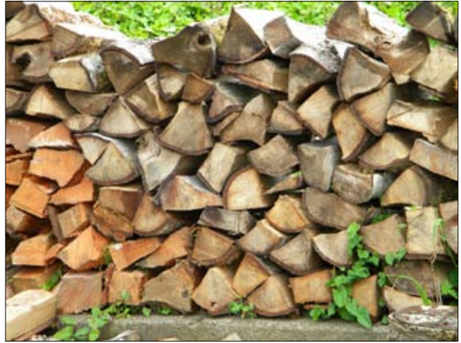
Figure 2.— Stacked firewood should have good air flow so that it dries properly.