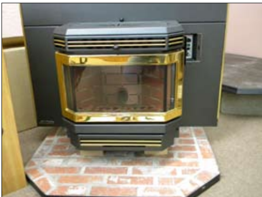
Figure 4.—Pellet stoves are more efficient than an open fireplace.