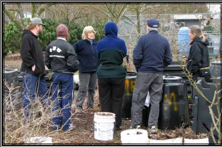
Picture caption: Composting class at the Linn County Master Gardener™ composting site on Feb 28th.

Linn County Fair & Expo Center 3700 Knox Butte Road Albany, Oregon April 2009