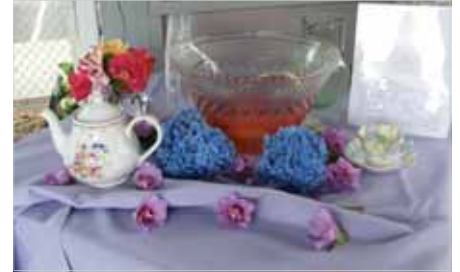
LCMGA's garden tea party décor and refreshments.