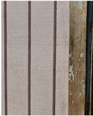
"Before" photo of the peeling paint on the shed.

Recently a shed addition was completed which allows us better access to