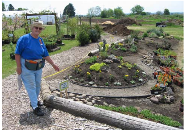
Master Gardener demonstration garden.

The Master Gardeners have built and manage a demonstration garden behind the office on Center Street. It is utilized as a tool for master gardener training and public workshops on gardening topics, and it is the only facility of its type in Salem for teaching sustainable gardening practices. It was used this year for a workshop on tree fruit pruning. In addition, the beneficial insect garden was expanded in 2007 and was the subject of a workshop in September. Construction of "Every Body's Garden" continues and currently consists of three raised beds and also includes a water feature and gazebo. A new potting shed was added this year.