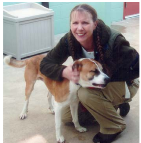
Shelter dog walker takes time out for a friendly hug.

Volunteers at the shelter were part of many beneficial, positive and rewarding experiences in 2007. In February, three volunteers shared the first volunteer fostering opportunity of "Marion" and her seven puppies. The shelter held its first Adoption Outreach on April 7 at Pet, Etc., in West Salem where "Marion" and her puppies were highlighted. Four puppies were adopted that day, the remaining three were adopted the following week, and "Marion" was adopted in June.