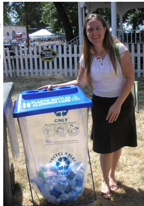
AmeriCorps volunteer encouraging recycling at the Marion County

A Woodburn middle school without a recycling program at the beginning of the school year became Oregon Green School. They found many ways to reduce waste and bring the recycling message to the entire school through implementing a school-wide recycling program that included a kitchen recycling program. Kitchen recycling reduced trash from 200 gallons per day to 50 gallons and cafeteria garbage was reduced from 945 gallons to 315 gallons per day, resulting in a total reduction of 780 gallons of garbage per day!