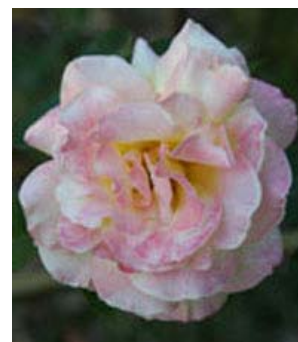
Dreaming of Summer