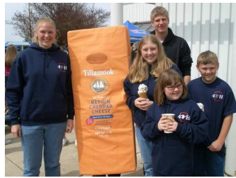
Kountry Kousins 4-H Dairy Club attended the Tillamook County Young Dairy Judging Contest.