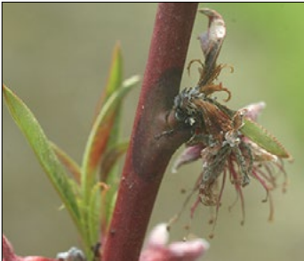
Figure 5. Brown rot blossom blight is a fungal disease of peach. The disease moves from the flower into the shoots.