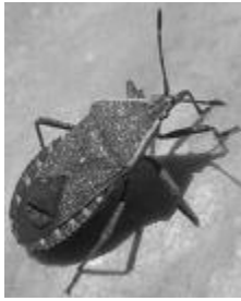
Adult Anasa tristis