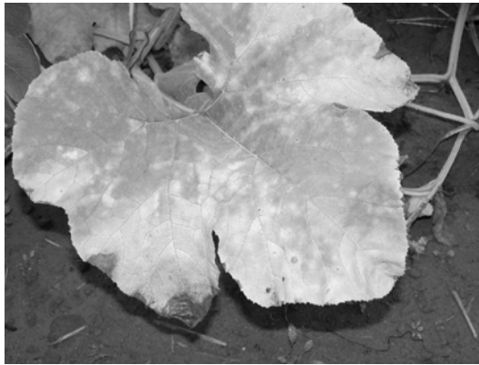
Leaf damage caused by feeding nymphs and adults

Hot weather during the last week of June brought with it a familiar pest to gardeners—squash bugs. A true bug of the Hemiptera order, squash bugs ( Anasa tristis ) are a common pest in the garden. Using their piercing mouth parts to feed, the squash bug weakens plants by causing leaf necrosis and scarred fruit. Heavy infestations of squash bugs will cause a plant to loose runners, wilt and in some cases, die. Hiding under debris in sheltered garden spots they emerge in the spring to mate and find a place to lay eggs. Damage is limited to members of the curcubit family such as summer and winter squash, melons and pumpkins. They are difficult to control using chemical means as the bugs and egg masses are difficult to reach. The best control is achieved through cultural practices and garden sanitation. Knowing the life cycle of the insect is most important for control.