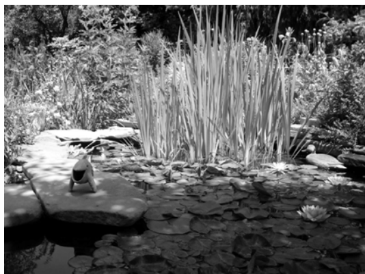
One of the highlights of last July's Garden Tour