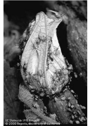
Nymphs covering a squash blossom

* Egg casings are fairly easy to spot. The reddish color of the eggs is distinct against the leaf and are easy to dislodge. Pick off and destroy egg masses as soon as you see them. If eggs are left to develop they will hatch and feed on plant juices.