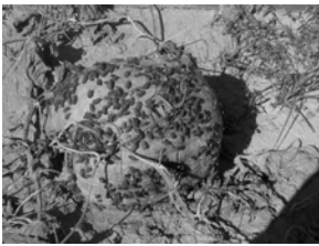
Anasa tristis adults cover a pumpkin and will over-winter to produce next year's generation