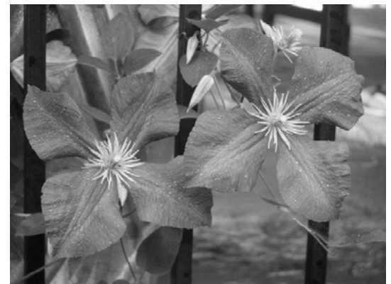
Five inches of rich purple per flower and twelve flowers on a young Clematis jackmanii. A summertime favorite."

Come learn safe techniques for preserving your tomato bounty. Tomatoes are considered borderline in acidity, so learn how to compensate for that. Come learn how to safely preserve tomatoes in combination with other ingredients such as peppers, onions, and fruits.