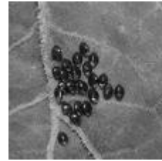
Anasa tristis eggs

CONTROL: Inspect plants often for signs of squash bugs. The easiest and most cost effective control method starts at the beginning of the life cycle.