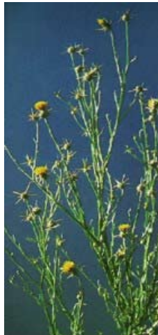
Figure 1.—Mature yellow starthistle.

Yellow starthistle is a winter annual, maturing at heights of 24 to 72 inches (Figure 1). A rosette of deeply lobed leaves up to 8 inches long forms after seed germinates in the fall (Figure 2). Yellow flower heads develop at the tips of branched stems from late spring until fall. Flower heads bear stiff, sharp thorns about 0.75 inch long (Figure 3). Each seed head produces from 35 to 80 seeds. The seeds cannot disperse via wind, so they need help to move more than a few feet from the parent plant. Human activity such as off-road vehicle and pedestrian travel, cattle grazing, and road and power line maintenance contribute greatly to the plants' rapid and long-distance spread.