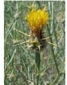
Figure 3.—Yellow starthistle flower and spines.

The following information about herbicides is only a brief summary; consult your local Extension agent or Oregon Department of Agriculture representative for