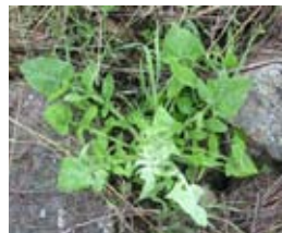
Figure 2.—Yellow starthistle rosette.