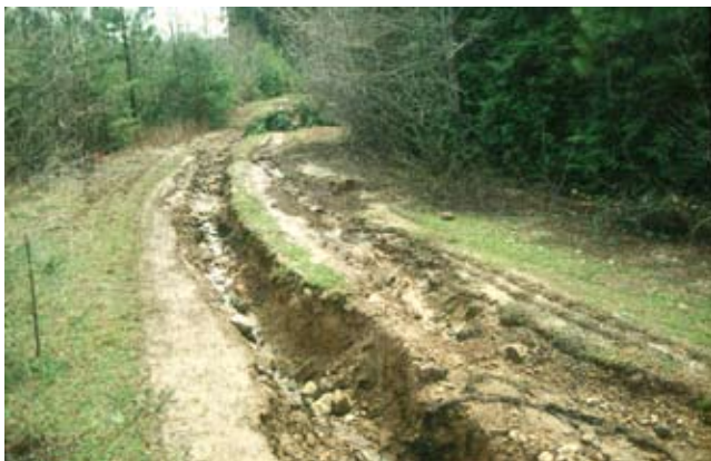
Figure 5.—Poor roads can limit your ability to take advantage of market opportunities.

A lump-sum sale sets a fixed price for all timber in the designated sale area. Whether the buyer removes a single tree or every tree in the designated area, the total price is the same. This sale type is attractive to some sellers because it shifts much of the