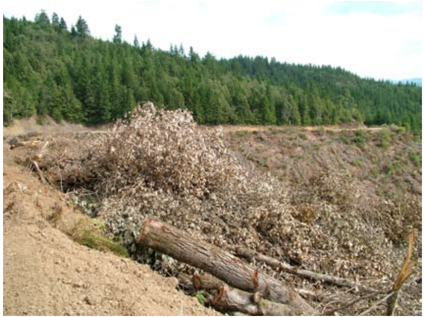
Figure 11.—If the logging contract specifies postharvest treatment for slash and debris, make sure this has been done to your satisfaction before the logger removes equipment from the site.

It is also extremely important to get a trip ticket for each load of logs that leaves the property. For each load hauled, the trip ticket records the date, time, truck driver identification, destination, and number of logs. This information is of paramount importance for accurate load tracking and payment verification. When you receive the mill's summary of the scale tickets, you can refer to your trip tickets to ensure you are properly credited and paid for your logs.