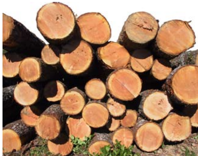
Figure 1.—The vast majority of timber harvests on private woodlands are log sales.

This publication provides a step-by-step overview of selling timber, along with references to other sources of information. The steps are derived from the experiences of landowners, consultants, loggers, and log buyers and are presented in the order they should be taken to ensure a successful