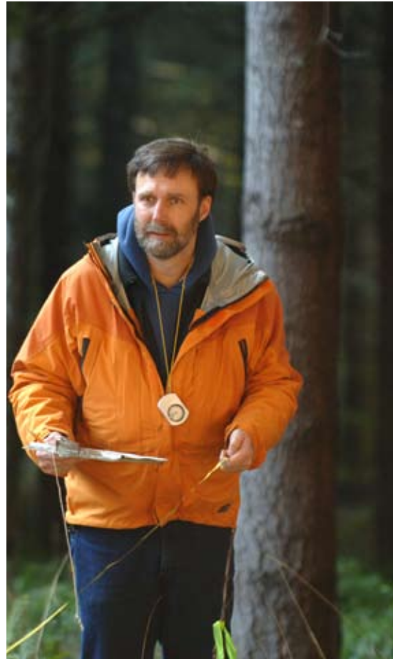
Figure 3.—A key to effective marketing is knowing what potential products you have in your forestland.

Friends and neighbors Friends and neighbors often are eager to give marketing advice gleaned from personal experience. They can help you get a feel for the way different ownership sizes, logging conditions, timber types, and other factors shape marketing strategies and experiences. Neighbors and friends also may have information on potential markets and pricing, and generally they are happy to share information and advice they found useful. However, be cautious about information from other landowners. Their experience may be limited to one or a few sales—and