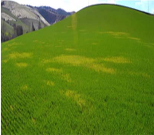
Photo 1. Characteristic chlorotic patches in winter wheat caused by Soil-borne wheat mosaic virus.

The incidence of Soil-borne wheat mosaic virus (SBWMV) is on the rise in the Walla Walla Valley this year (14-22 in rainfall zone). Producers who have not previously had SBWMV in their fields have recently