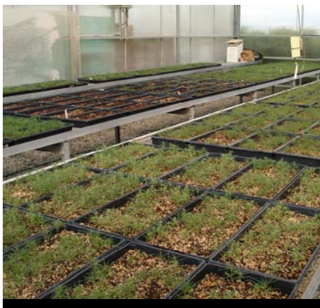
Screening Russian thistle populations in the CBARC greenhouse.