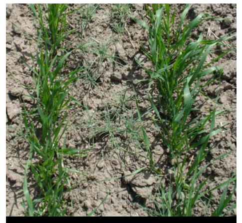
Russian thistle infestation in wheat.