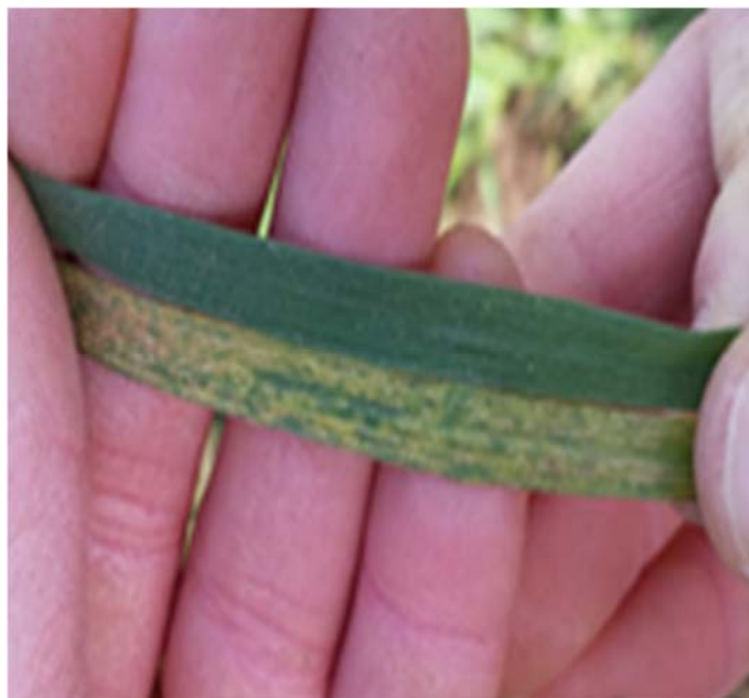
Photo 2. SBWMV resistant cultivar (top leaf) vs. susceptible cultivar (bottom leaf). Susceptible leaf displaying characteristic mosaic-like pattern.

If you suspect SBWMV, please contact me at the email listed above