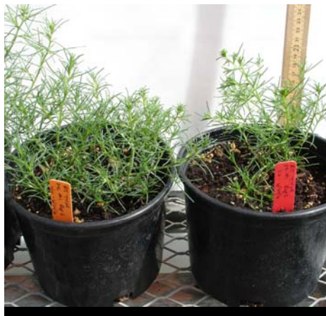
Detail of Russian thistle plants resistant to glyphosate 3 weeks after being treated with glyphosate at 4X and 8X.