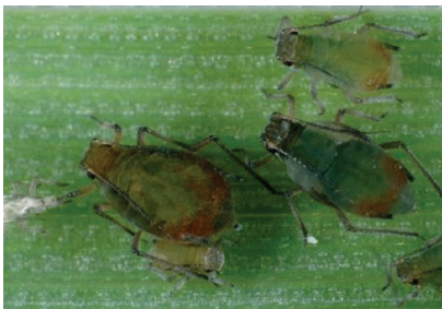
Bird cherry-oat aphid

This spring, OSU Extension will be re-evaluating the status of aphids in wheat looking at the potential for aphids to vector virus or inject toxins into wheat. Our focus will be on cherry-oat aphid, corn leaf aphid, English grain aphid, greenbug and the Russian wheat aphid in both the irrigated and dryland wheat in the Columbia Plateau region.