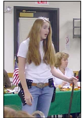
Entertainment provided by Whitney Ward