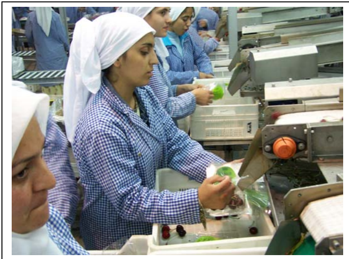
Turkish employees prepare consumer packs for export to Europe in this modern packing facility near Bursa.

Although Turkish cherry production has leveled off in the first five years of this century, the late 1990's saw steady production increases as Turkey overtook the USA as the top producer of cherries in the world. Traditional cherry orchards, averaging less than 2,000 m 2 (0.5 A) are found throughout central and western Turkey. These orchards are often a mixture of several crops including cherries, olives and figs and are rarely pruned.