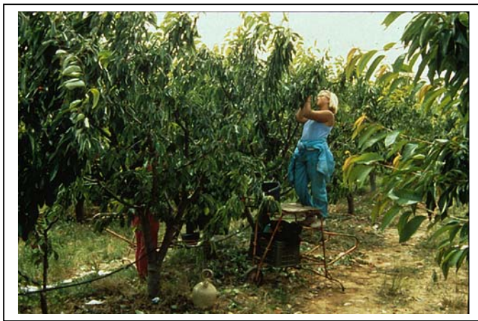
Fig. 1 Spain harvest: Pedestrian orchards, such as this Spanish Bush orchard, allow for fast and efficient harvest and are much safer for workers.

Both the Vogel Spindle and Spanish Bush systems will allow for the development of a “pedestrian orchard”. A pedestrian orchard is defined as an orchard where two-thirds of the crop can be harvested from the ground, without the use of tall ladders (Fig. 1).