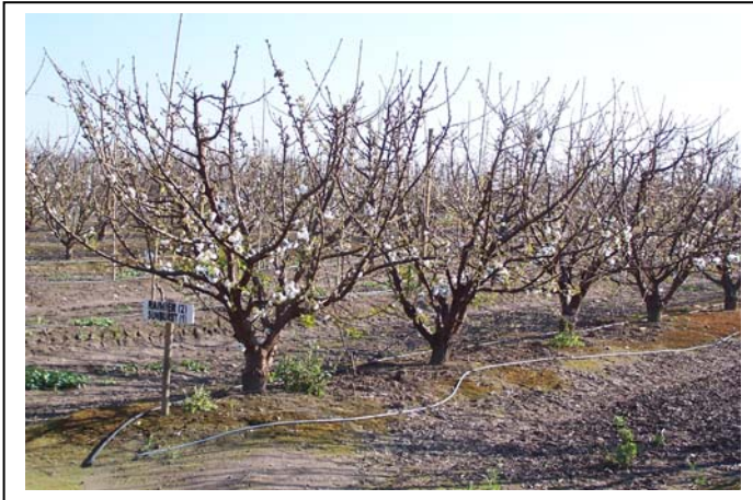
Fig. 2 A tree trained to the true Spanish Bush system will have 8-10 permanent upright leaders. Fruit is produced on weak laterals that are renewable.

The true Spanish Bush was developed in the Ebro Valley of Spain where it is grown on a mahaleb rootstock selection called Sante Lucia 64. Even though this is not a dwarfing rootstock the combination of poor soils and a multi-leader system combines to maintain an ultimate height of only 8 feet (2.4 m). On more productive soils it is best to use a semi-dwarfing rootstock such as Gisela 6 to help control tree height.