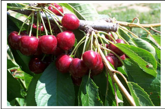
Fig. 4 Older lateral branches are stubbed back on Vogel Spindle trees in order to reduce the crop load and renew old spurs.

The Vogel Spindle was developed in the Franconia region of Germany by Mr. Tobias Vogel. Dwarfing or semi-dwarfing rootstocks will help to limit maximum height to 10 – 12 ft (3 – 3.7 m). Lateral branches are bent to a horizontal angle in the establishment years rather than pruned, so the system is highly precocious. With this system it is often possible to get commercial yields in the 3 rd leaf. Due to the productive nature of the system there is a tendency for trees to overset. For this reason it is important to tip all new growth as described above and begin branch renewal by the third leaf. All branches are renewable, even basal branches. About 1/5 of the lateral branches emanating from the trunk, should be renewed each year by stubbing branches back to a 6 – 12 inch stub in