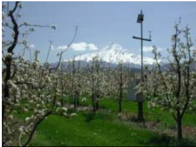
One of several weather stations in the Hood River Valley.

The last stop on the tour will be at Graves Orchards in Odell. Blueberry production is not new to the Hood River Valley. Growing blueberries specifically for a processing market, however, is relatively new. Randy Graves has established a blueberry planting with varieties that produce medium sized berries destined for the Gorge Delights Pear Bar. We will discuss several aspects of this alternative enterprise.