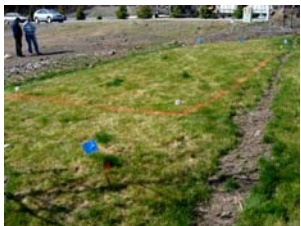
marking out location of shed at The DIG