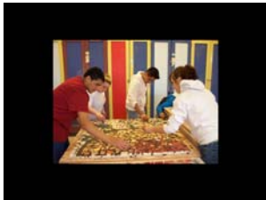
art students working on tile mosaic for The DIG