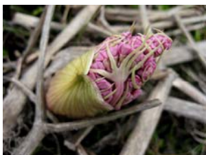
Columbia desert parsley