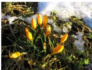
early crocus with snow