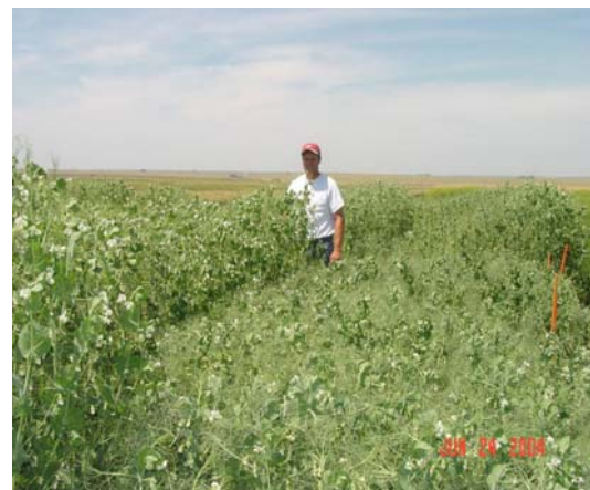
Alternative Crops—Winter Peas