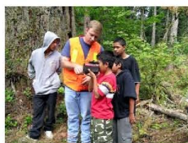
Explore Creeks and Forests.

Oregon State University Extension Service offers educational programs, activities, and materials without discrimination based on race, color, religion, sex, sexual orientation, national origin, age, marital status, disability, and disabled veteran or Vietnam-era veteran status. OSU Extension Service is an Equal Opportunity Employer. Reasonable accommodations will be provided to those with physical or mental disabilities in order to attend Extension programs. Please contact the Extension office in advance to make arrangements. Oregon State University is an Equal Opportunity Employer.