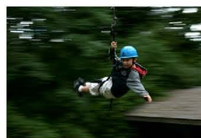
Forest Super Swing, Swimming & Canoeing