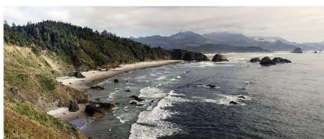
Venture out to sea and explore the coastal zone