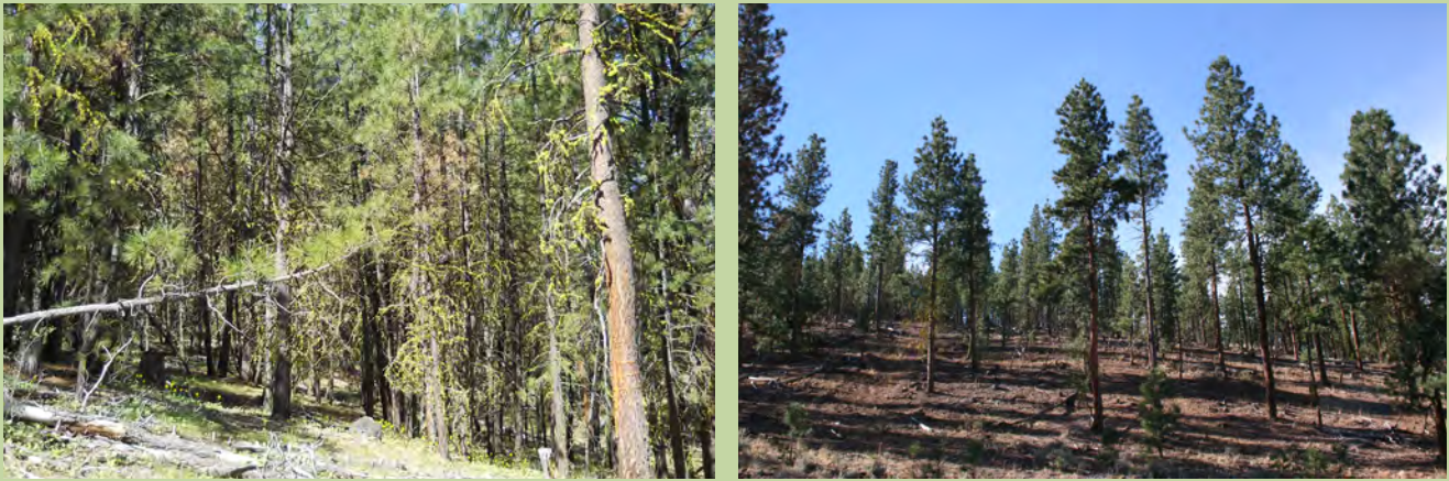
Untreated (left) and treated (right) ponderosa pine stands