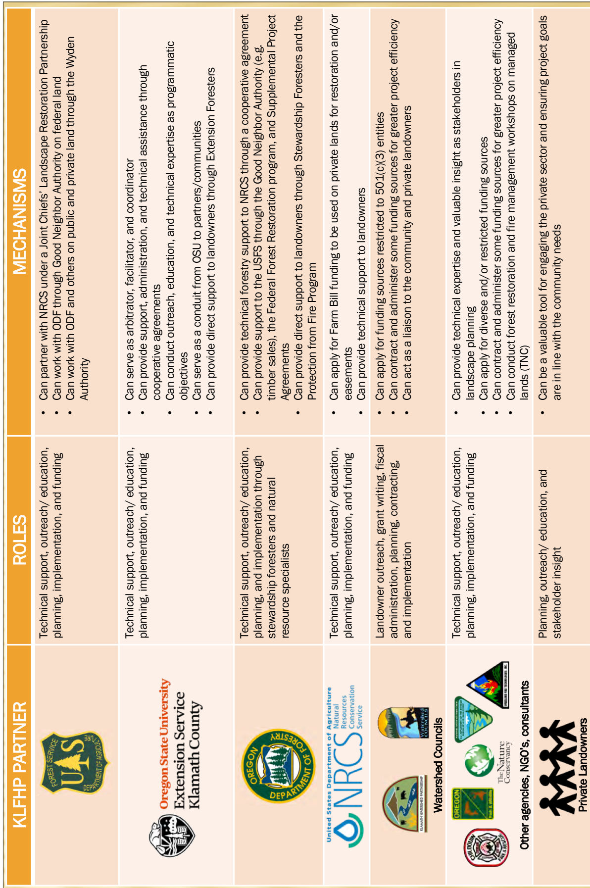
Roles and mechanisms for each KLFHP key agency and organization