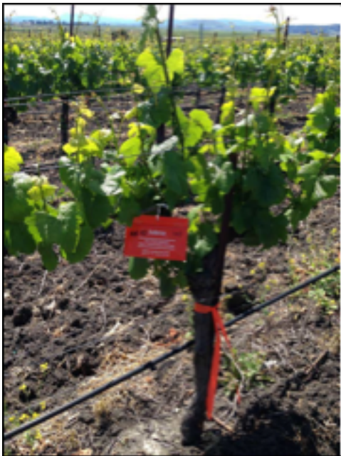
Figure 2. Proper placement of a delta trap in the vine canopy, along the fruiting wire.

4. Trap placement within the vine: Ideally, traps should be placed within grapevines and not in other plants on the property. Traps should be placed at the fruiting zone/cordon height within rows (Figure 2).