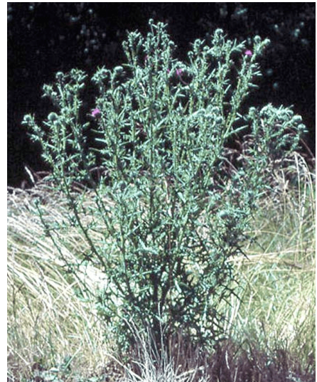
Figure 2. Second-year (mature) bull thistle.