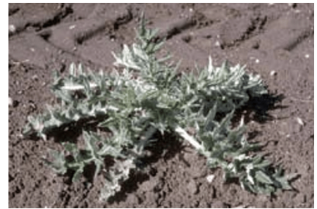
Figure 1. Bull thistle rosette.

Bull thistle is a biennial forb. In the juvenile phase (see Figure 1), the bull thistle develops a rosette with a fleshy taproot which can be as long as 28 inches. The second-year plant develops spiny wings from 1 to 5 feet tall with many spreading branches (Figure 2). Leaves are tipped with stout spines. The pinkish purple flowers, which appear from July through September, are 1.5 to 2 inches wide and are usually solitary. Seeds are dispersed by the wind and may remain viable in the soil for 10 years.