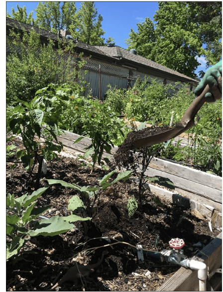
Figure 5. Add compost to soil. It will help bind lead to the soil, reducing dust and lead solubility. Drip irrigation reduces splashing of contaminated soil onto the edible parts of plants.