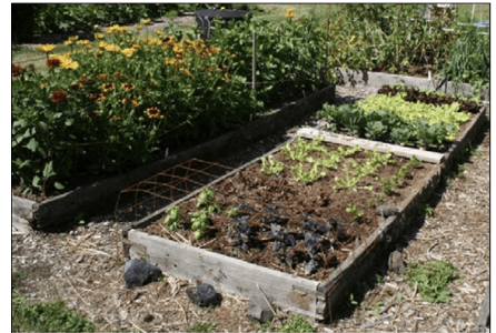
Figure 1. When metals in soil are a concern, grow leafy and root vegetables in raised beds filled with an uncontaminated soil or growing medium.