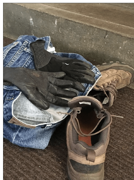
Figure 3. Reduce your exposure to contaminated soil by wearing shoes and gloves. Reduce contamination inside the house by leaving dirty or dusty clothes outside the living space.