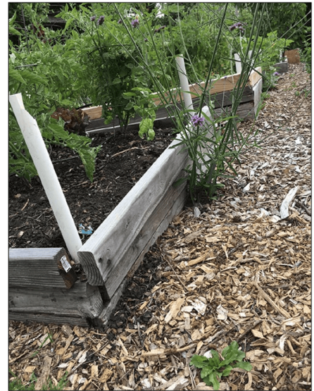
Figure 2. Covering bare soil with a thick layer of mulch will reduce exposure to contaminated soil.

It is not appropriate to interpret results from tests measuring available or dissolvable lead using Table 1. Table 1 cannot be used to interpret results from drinking water or plant lead testing. See the section “Soil tests for lead” and the sidebar “Which soil test? It makes a difference” for details on choosing a soil test. See section “Soil test interpretation for garden and bare soils” to understand the results of a soil test.