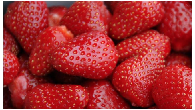
'Charm' (June-bearing)