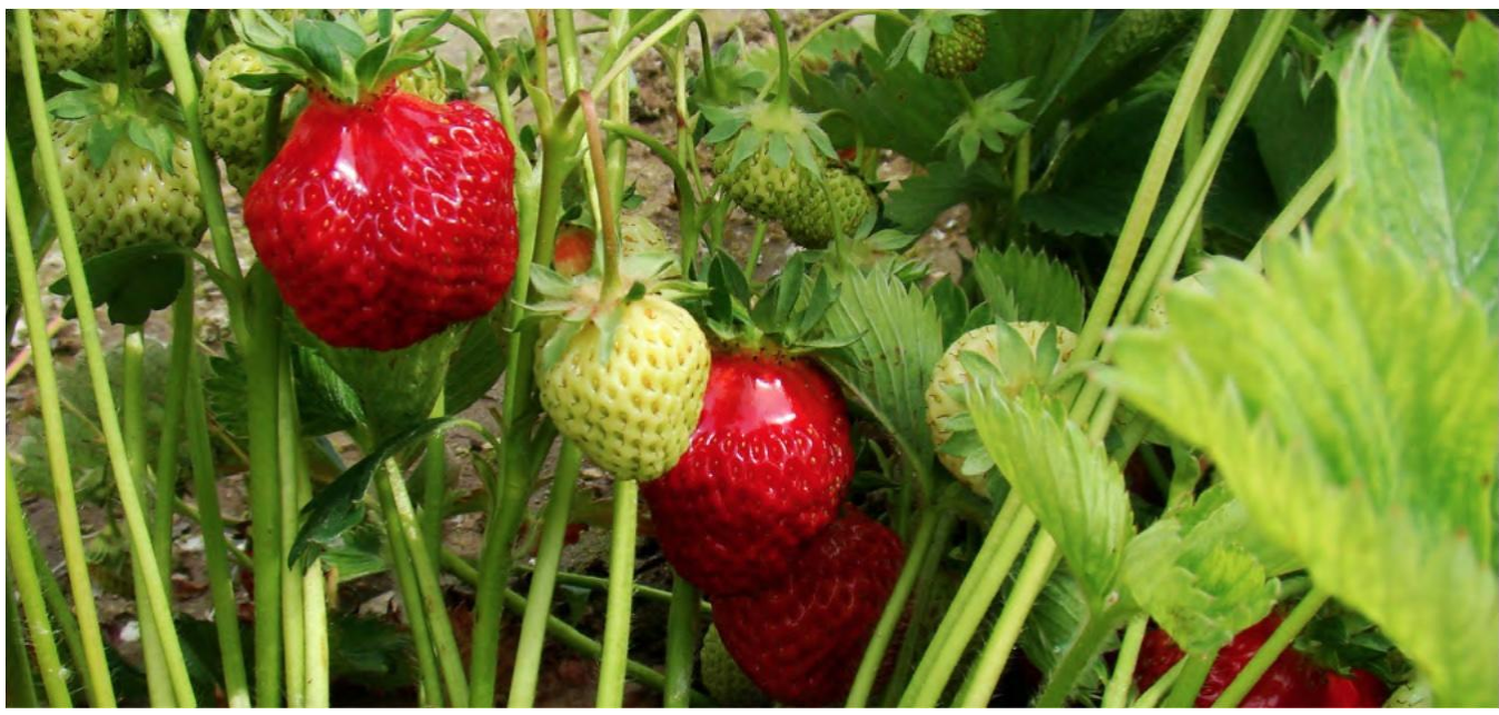
'Hood' (June-bearing)

Trade-name products and services are mentioned as illustrations only. This does not mean that the Oregon State University Extension Service either endorses these products and services or intends to discriminate against products and services not mentioned.