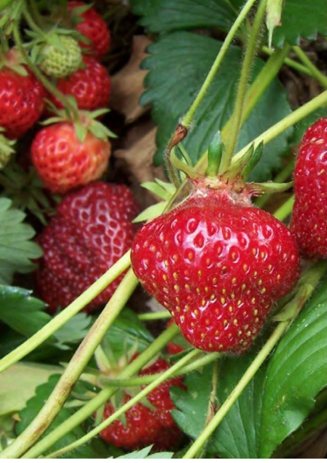
'Shuksan' (June-bearing) Photo: Bernadine Strik, © Oregon State University

'Tillamook' (June-bearing) Photo: Bernadine Strik, © Oregon State University