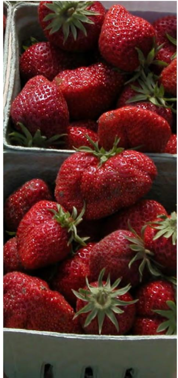
'Rainier' (June-bearing)