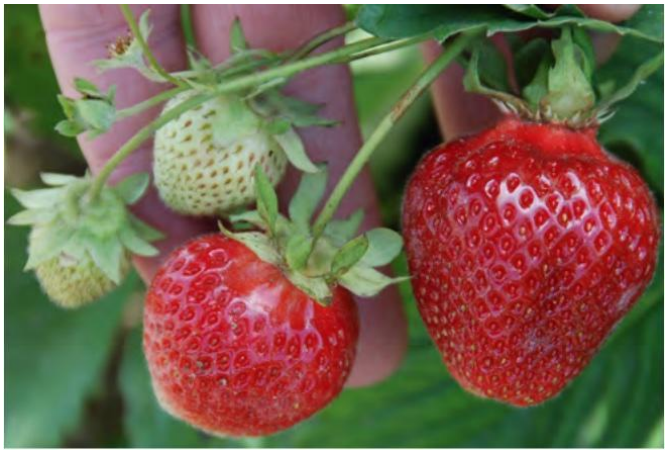
'Sweet Sunrise' (June-bearing)