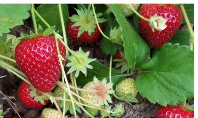
'Puget Reliance' (June-bearing)