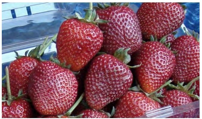
'Puget Crimson' (June-bearing)

Many California-developed June-bearing strawberry cultivars are available. However, many of these cultivars, including 'Camarosa', 'Chandler', 'Camino Real', 'Gaviota', 'Lassen', 'Tioga', 'Torrey', 'Tufts', and 'Ventana', are not good choices for the Pacific Northwest. The plants tend to be short-lived, not very productive, and have poor fruit quality. June-bearing cultivars are listed in Table 1.