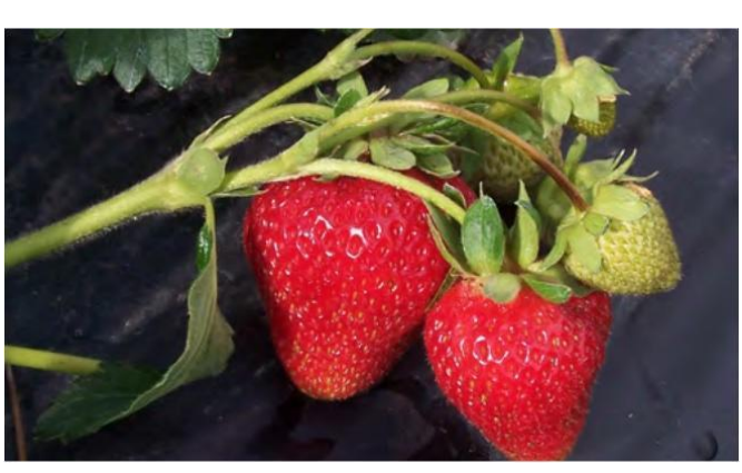
'Albion' (Day-neutral)