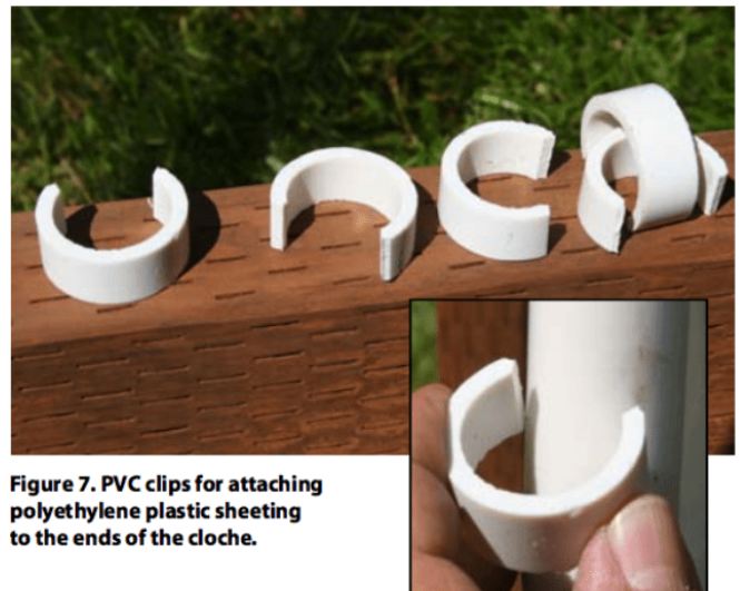
Figure 7. PVC clips for attaching polyethylene plastic sheeting to the ends of the cloche.