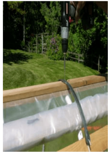
Figure 12. Attach the bungee cord at its center to the backbone. This will hold the rolled-up plastic for easy access to both sides of the raised-bed cloche.