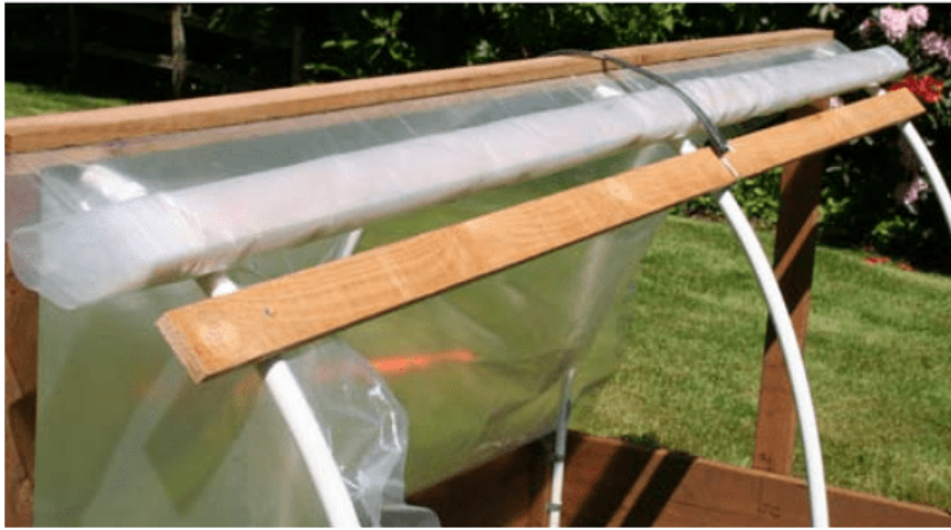
Figure 11. A D board attached to all the hoops 10 inches below the backbone on each side gives the structure extra strength and support.