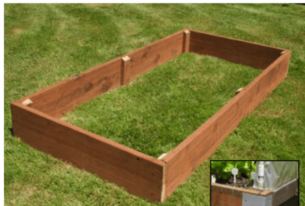
Figure 3. A raised-bed base with center and corner supports for an 8x4-foot cloche.

(Optional: you may add outside corner metal straps to the corners to further stabilize the raised bed base. Figure 3 insert.)