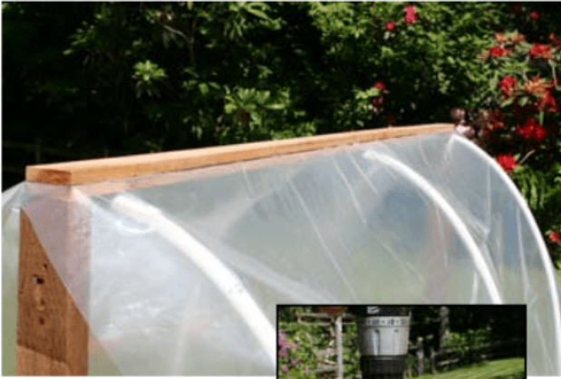
Figure 9. Sandwich and secure 10 x 10-foot plastic between the two D boards.

Place another D board on top of the backbone, sandwiching the plastic between the two, and screw down using 1.5-inch screws (Figure 9 and Figure 9 insert).