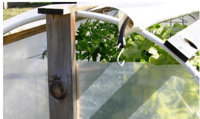
Figure 13. In warmer areas, cut out and leave open the top 6–12 inches of each end, for ventilation.

( http://www.wiley.com/WileyCDA/WileyTitle/productCd-047173828X.html ), 5th edition. ISBN 978-0-471-73828-2.