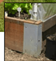
Figure 3 insert. Outside corner metal straps add stability to the raised-bed base.