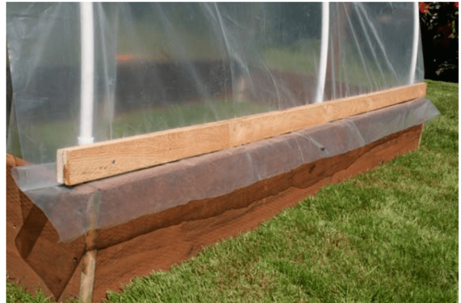
Figure 10. Secure the side curtain plastic with two D boards that sandwich the plastic and rest on top of the raised bed. Trim excess plastic, but leave 6 to 8 inches of overhang.