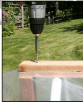
Figure 9 insert. Secure the plastic with 1.5-inch screws.