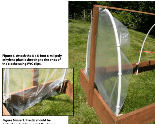
Figure 6. Attach the 5 x 5-foot 6-mil polyethylene plastic sheeting to the ends of the cloche using PVC clips.

Make the PVC clips by sawing off a third of a section of 1-inch PVC (Figure 7 and Figure 7 insert). Pull plastic tight and make adjustments, being careful that clips do not dig into the plastic. Trim extra plastic but leave a good 6 inches of excess (Figure 6).