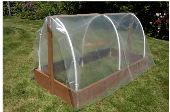
Figure 8. Drape the 6-mil 10x10 polyethylene plastic sheeting over the hoops of the cloche.

Drape the 10x10 piece of 6-mil polyethylene plastic sheeting over the hoops, making sure each end and the bottom sides are even (Figure 8). Do not trim excess plastic until later.