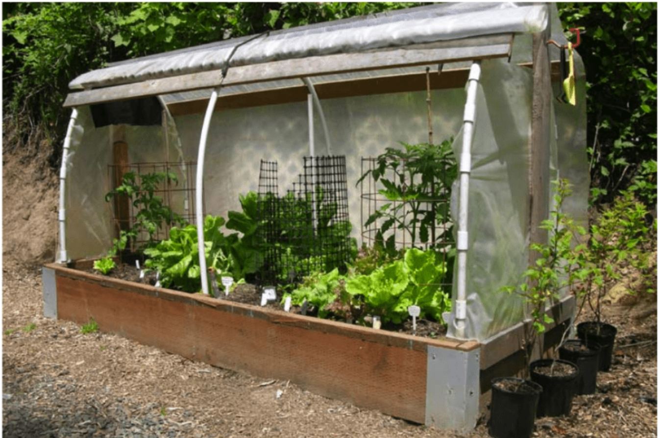
Figure 1. An 8x4-foot cloche used for growing vegetables, Newport, OR.