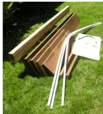
Figure 2. Materials needed to build an 8 x 4-foot cloche.