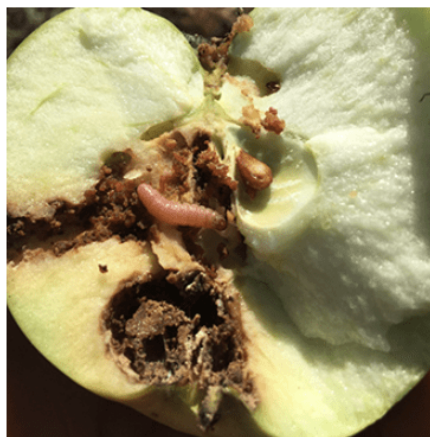
Figure 2. Codling moth is common wherever apples are grown.