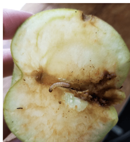
Figure 3. Codling moth is generally a problem near the core of the apple.