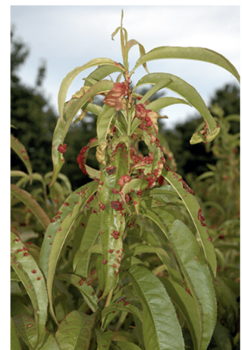
Figure 6. Peach leaf curl is easy to recognize but hard to manage.