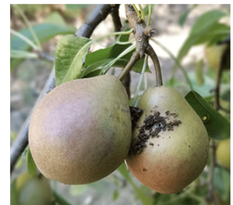
Figure 4. Codling moth entrance hole in fruit.

Note: Several Oregon counties have ordinances that require home fruit growers to use minimum spray programs to prevent disease and insect spread to commercial orchards. See “Required pest control programs” for requirements in specific counties. Applications for pests indicated with a *, if they are applied at the correct time, should meet the requirements of most counties. Check with your local Extension agent if you are not sure.