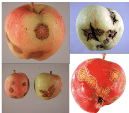
Figure 1. Apple scab is a common problem on apples grown west of the Cascades.

Commercial growers must control diseases and insect pests of apples. Most of the time, it is not practical for home fruit growers to try these control practices on large apple trees.