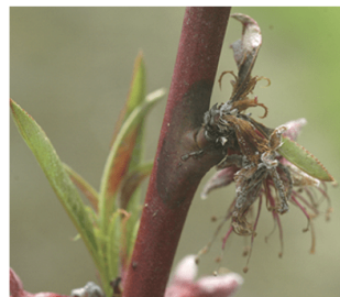
Figure 5. Brown rot blossom blight is a fungal disease of peach. The disease moves from the flower into the shoots.

Note: Several Oregon counties have ordinances that require home fruit growers to use minimum spray programs to prevent disease and insect spread to commercial orchards. See “Required pest control programs” for requirements in specific counties. Applications for pests indicated with a *, if they are applied at the correct time, should meet the requirements of most counties. Check with your local Extension agent if you are not sure.