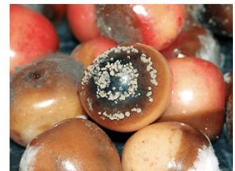
Figure 7. Brown rot fruit rot of cherry.

Commercial growers must control diseases and insect pests of cherries. Most of the time, it is not practical for home fruit growers to try these control practices on large cherry trees.