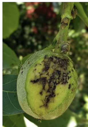
Figure 8. Husk fly damage is a common problem with backyard-grown walnuts.

Note: Several Oregon counties have ordinances that require home fruit growers to use minimum spray programs to prevent disease and insect spread to commercial orchards. See “Required pest control programs” for requirements in specific counties. Check with your local Extension agent if you are not sure.