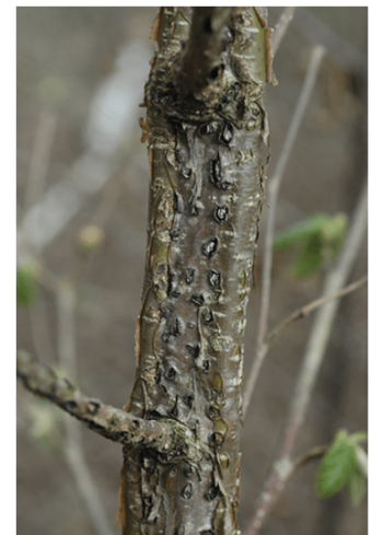
Figure 10. Eastern filbert blight is a problem on older varieties planted and grown before 2009.