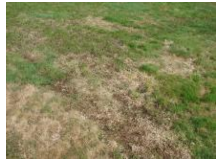
DAMAGE: European crane fly infestations often appear as thinning turfgrass. In extreme cases, larvae can completely destroy a lawn.

Aboveground symptoms include thinning turfgrass beginning in February, progressing to total loss of turfgrass in April and May in wet, low-lying areas. Birds, skunks and raccoons will often forage for the larvae in infested areas, causing further damage. In extreme cases, populations reach levels capable of completely destroying a lawn. In these instances, the larvae often move across the soil surface in search of more grass to consume.