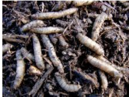
LARVAE: Survive best in rainy fall weather.