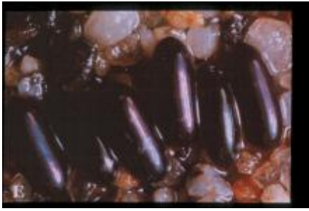
EGGS: Deposited in mid-September.