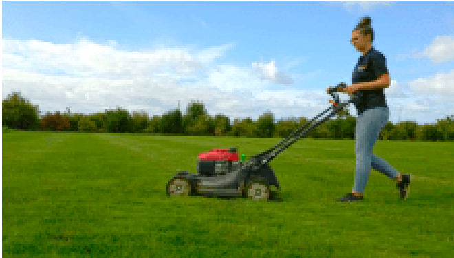
MOWING: Once a week.

Apply 0.25 inch of water four times per week (a total of 1 inch), from Memorial Day to Labor Day. You may need to adjust this amount based on current weather and soil conditions. Frequent summer irrigation is key when trying to maintain turfgrass affected by European crane fly. The crowns and root systems, which were damaged the previous winter and spring, need regular water to recover.