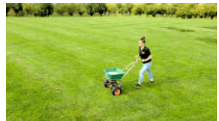
FERTILIZING: Follow recommended rates.

Perennial ryegrass, which is used west of the Cascades, and Kentucky bluegrass, which is used east of the Cascades, should also receive two fertilizer applications in the spring (around the end of May and June) and two applications in the fall (around the end of September and October) (Table 1). Fertilizer for turfgrass should have high levels of nitrogen, low levels of phosphorus and moderate levels of potassium (sample ratio 25-5-10 N-P-K).