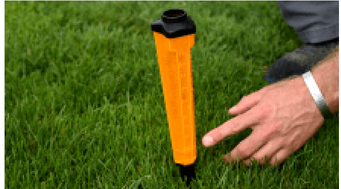
IRRIGATING: 0.25 inches four times a week.