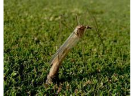
An adult crane fly emerges from the grass in late summer.

European crane fly larvae feed on turfgrass shoots, crowns and roots, causing substantial damage in early spring. Proper turfgrass management can substantially reduce the damage caused by this insect. In cases of extreme infestations, scouting and properly timed insecticide applications can prevent turfgrass losses.