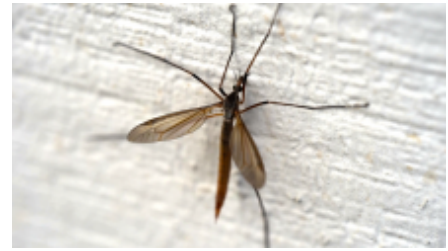
ADULTS: Live only about one month.