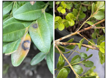
Figure 3. Boxwood blight can cause symptoms such as leaf spot (left) and dark lesions on the stems.