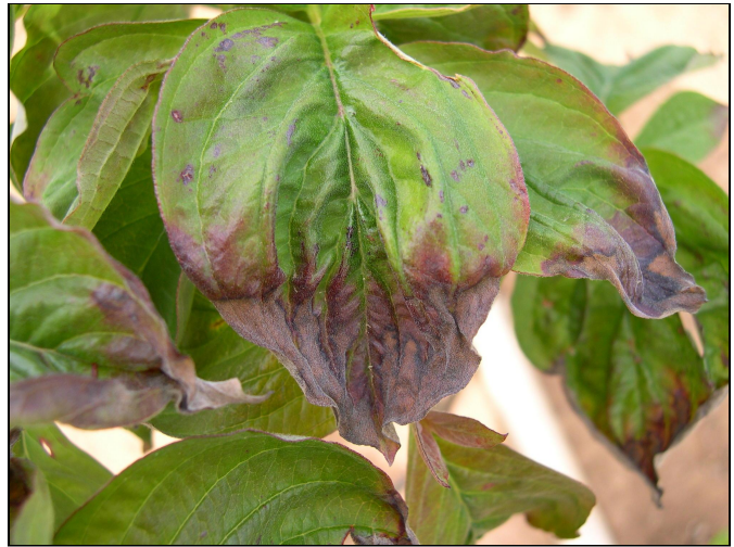
Figure 7. Anthracnose is a term used to describe many different fungal pathogens. Symptoms depend on the host, such as this dogwood ( Cornus sp.).