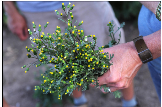
Figure 6. Weeds are a major issue for all sectors of nursery production.