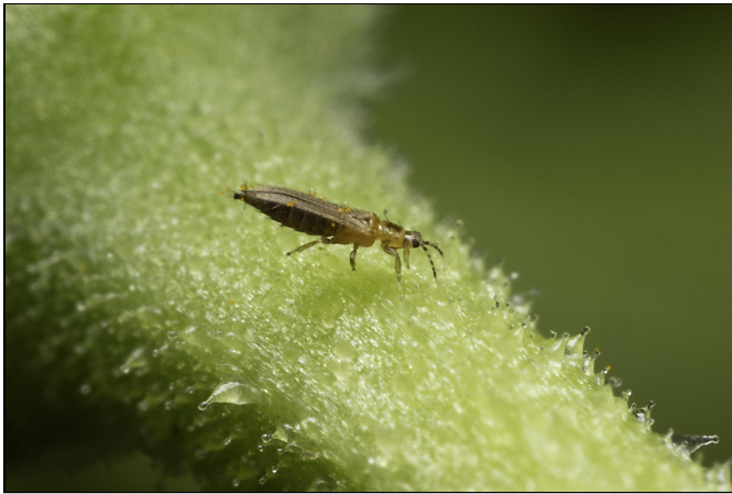
Figure 1. IPM strategies to manage western flower thrips ( Frankliniella occidentalis ) are a critical research need for Oregon nurseries.