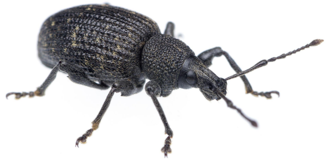
Figure 2. Vine weevils, such as Otiorynchus sulcatus , are one of the top pests for nursery pest managers.