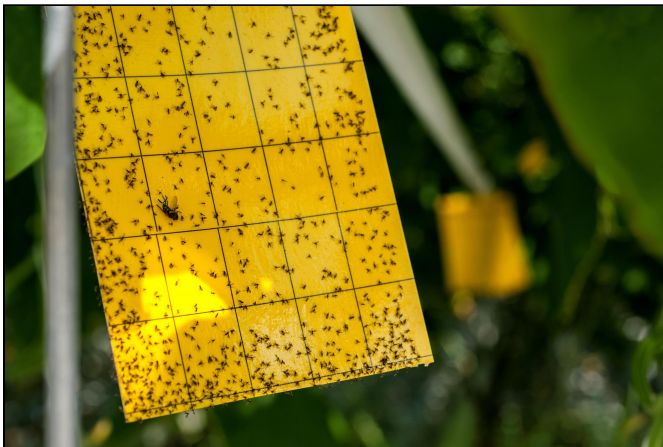
Figure 5. Sticky cards are a popular tool for monitoring pests in greenhouse production.