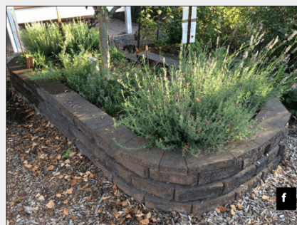
A bed built with retaining wall materials