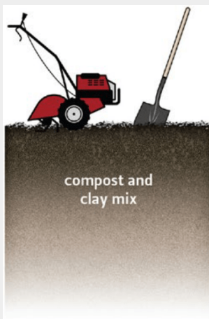
Illustration: Erik Simmons, © Oregon State University

Select the area for your garden. Add organic material and nitrogen to native soil.