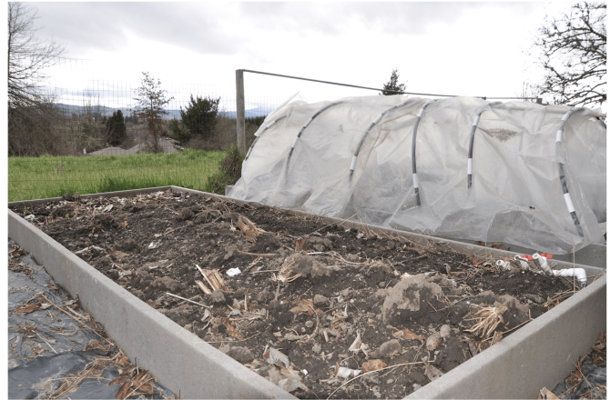
Raised beds can be either framed (above) or unframed.

For both types of raised bed, additional soil or organic material will be needed. Substantial quantities are required, so the soil or organic matter should be readily available and relatively inexpensive. Some options include native soil moved from other areas of the garden or bulk soil mixes purchased from garden centers or landscape supply companies. If your native soil is heavy and slow-draining, incorporate organic matter, such as finished home compost, purchased compost, composted leaves (leaf mold), or well-composted animal manures mixed with bedding material.