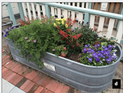
A metal trough with drainage holes