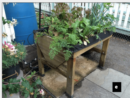
A wheelchair accessible bed