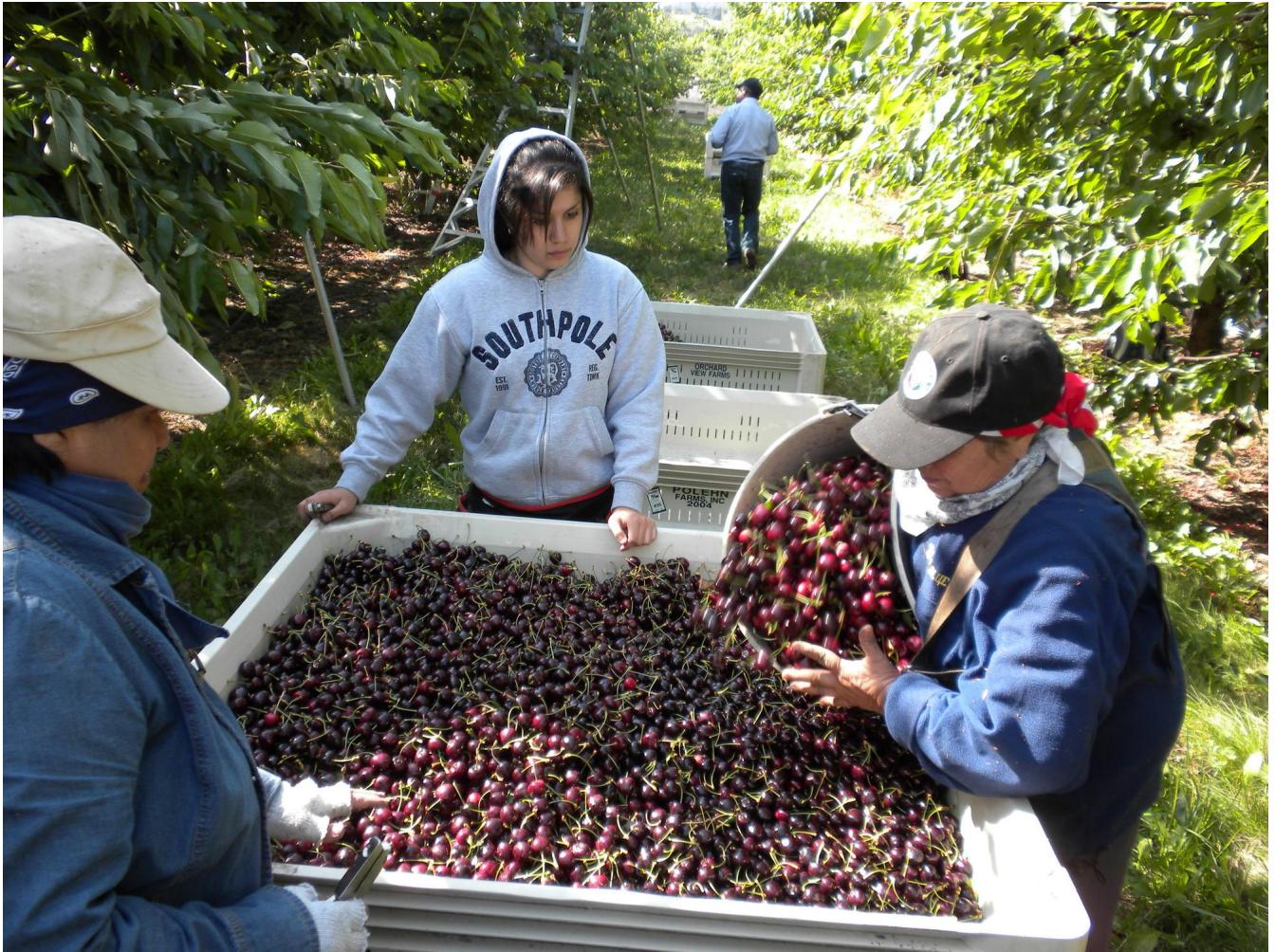
Workers harvest cherries in Oregon.