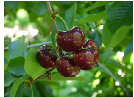
'Royal Helen' has a firm texture and a sweet-acid tang.

Much of what was said about 'Royal Edie' can be repeated here. Fruit size is large, averaging 9-row and larger. The firmness is excellent and the flavor is good, although somewhat mild with a sweet-acid tang. Rain-cracking potential is moderately high, but somewhat lower than 'Royal Edie' and 'Skeena'.