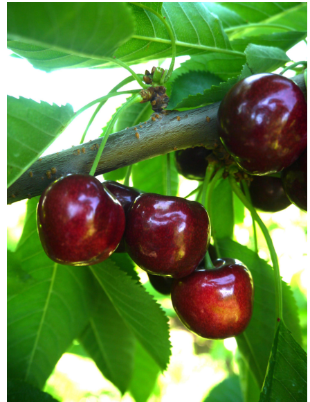
'Royal Edie' produces large fruit with firm, meaty texture.

'Royal Edie' is a large, mid- to late-season cherry. Fruit size averages 9 to 8½ row and for that reason alone it is worth consideration. The fruit are crunchy-firm with a rather meaty texture, somewhat lacking the juiciness found in most cherries. Flavor is mild. In two-hour soaking tests, rain-cracking potential was moderately high, which was confirmed by two natural rain events where cracking was high.