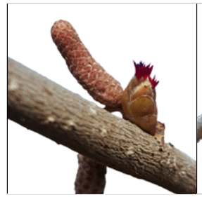
DORMANT SEASON STAGE 1A: Flowering. Female stigmas outside buds. From red dot to spider stage. STAGE 1B: Flowering. Male catkins just before elongation and pollen shed.