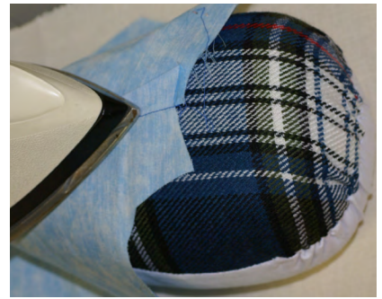
Figure 5. Pressing a dart using a pressing cushion.

Each brand of fusible web and interfacing has specific directions for use. It is good practice to test the fusible web or interfacing on a scrap of your fabric. Use a scrap that is large enough to leave part of the fabric unfused so you can compare the results.