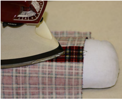
Figure 2. Pressing a seam allowance open using a seam roll.