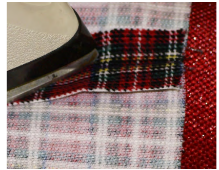
Figure 8. Pressing corduroy fabric.

DO NOT slide the iron on the fabric, and NEVER press on the right side. After steam-pressing an area, let it dry before you handle it again. Some pile fabrics cannot be pressed, such as fake furs. Finger-press seams open with your thumbnail.