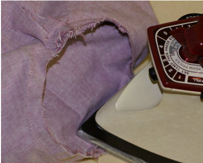
Figure 3. Pressing an armhole seam.