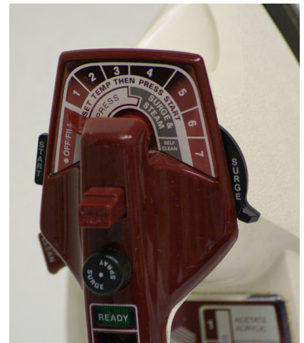
Figure 1. Heat settings on an iron.

Light pressure is needed to press most of today's fabrics. It is best to lower and lift the iron carefully, keeping most of the weight of the iron in your hand. Many steps of construction pressing use only the tip or the edge of the soleplate (bottom of the iron). Too much pressure often causes seams or darts to leave a mark or ridge on the front of the fabric.