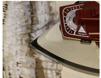
Figure 6. Pressing gathers.