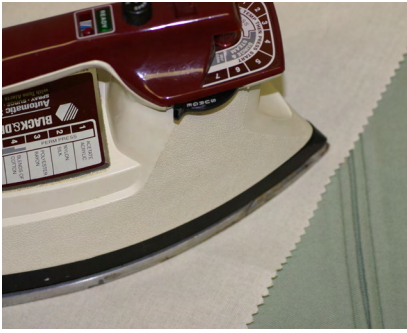
Figure 7. Pressing wool on the right side with a press cloth.