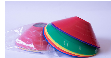
4. Place cones in the right-side pocket.