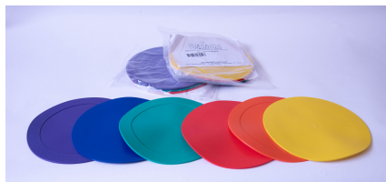
6. Divide the poly spots in half, placing some in the left pocket and some in the right pocket.