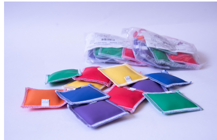
1. Insert bean bags into the buckets.