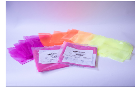
3. Lay scarves alongside the buckets.