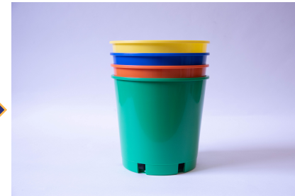
2. Lay buckets with bean bags on their side in the bag.