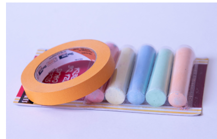
7. Insert tape and chalk into the mesh pocket on the left side.