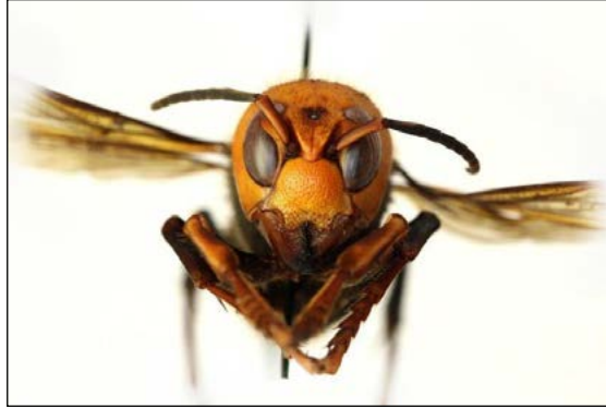
Dorsal view (left) and anterior view (right) of the Asian giant hornet ( Vespa mandarinia ).